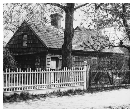
Oldest House, built 1761

The first settlers came from Huntington. They got along peacefully with the Indians as land was cleared for farms and trees were cut for buildings and cordwood. The early settlers used the Indians' path to the harbor when they fished, and they followed their hunting trails through the woods. One of the early settlers, Bryant Skidmore, built a house in 1761 that still stands at 529 Main Street. This house is close to the original center of the community, then called Red Hook (changed to Vernon Valley in 1820), at the five-corner junction of Main Street, Fort Salonga Road (Route 25A), Waterside Road and Vernon Valley Road.