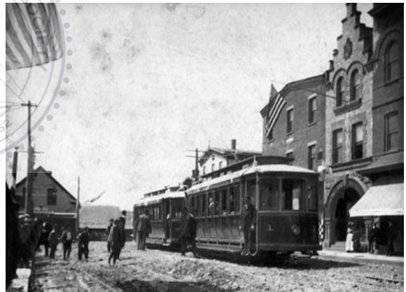
Trolley service began in 1902