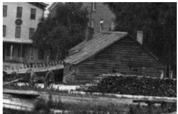
Cordwood at the landing, 1878