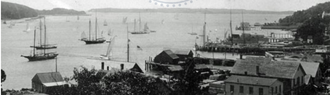
Northport Harbor, 1898