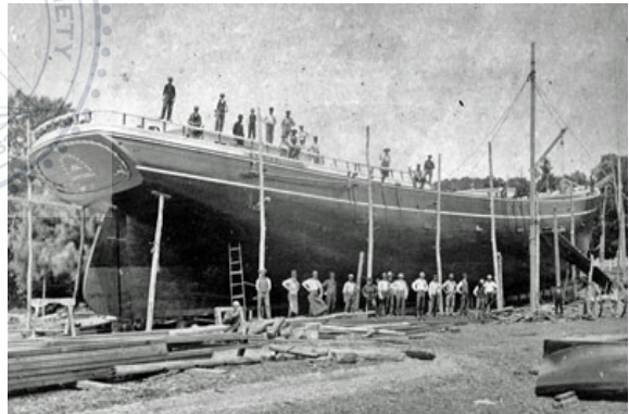
Carl Shipyard, 1883

Ferry service between Northport and New York City began early in the 19 th century, with vessels making a daily trip and lying overnight in Northport. At the end of the century steam power made the trip faster and more predictable.