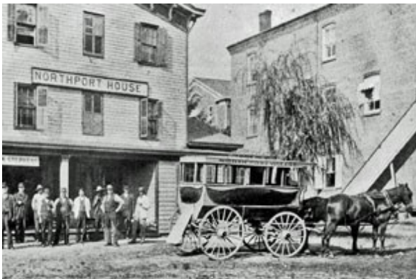
Stagecoach at Northport House, ca 1885

Several hotels were built in Northport to house visitors and traveling salesmen, the first being Northport House at the corner of Main Street and Bayview Avenue, begun in 1824. A horse-drawn stage service connected locally with all the hotels and, beginning in 1867, with the newly completed railroad. The stagecoach was also a primary link with the larger village of Huntington.