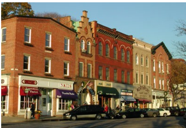
Main Street, 2007

Fishing and shellfishing continue on in Northport with a dedicated commercial dock near the Village Dock serving the needs of the baymen. Pleasure boating provides not only an important recreational activity for area residents but also brings many visitors from afar who frequent the restaurants and shops along Main Street and Woodbine Avenue. A bustling Farmers Market, sidewalk dining, free concerts in the park and other incentives have kept the downtown area busy throughout the year. Service businesses have chosen to locate in Northport because of its unique location appeal and convenient access to New York City.