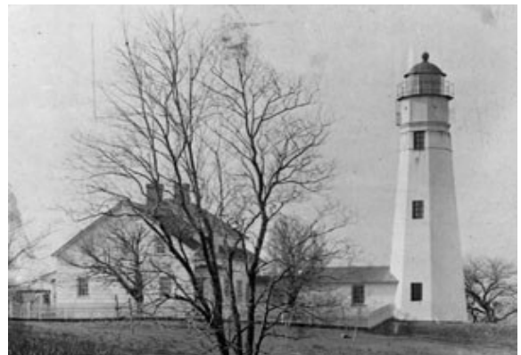
Eatons Neck Lighthouse, erected 1798

In 1795 it was written that “we find off Eatons Neck a great reef of rocks, dangerous to shipping with many vessels having been wrecked there. It is expected a lighthouse will be built for the advantage of the seamen.” In 1798 the new government of the United States built the Eatons Neck Lighthouse, the second oldest lighthouse on Long Island. Today, the lighthouse is managed by the U.S. Coast Guard.